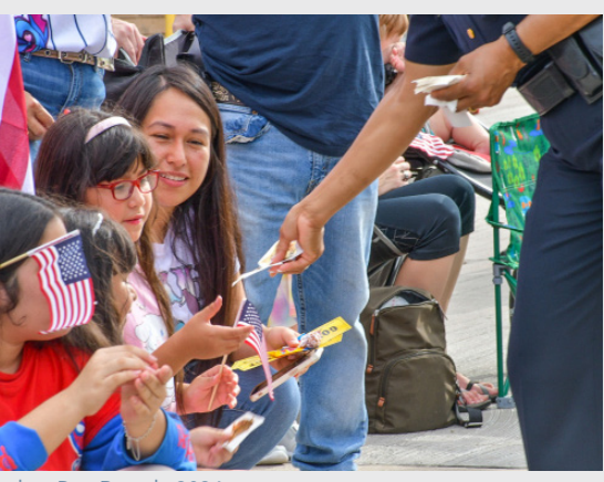
Labor Dav Parade 2024