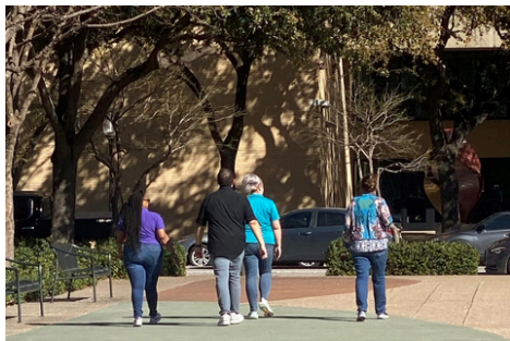
Taking a stroll to promote exercise and reduce stress