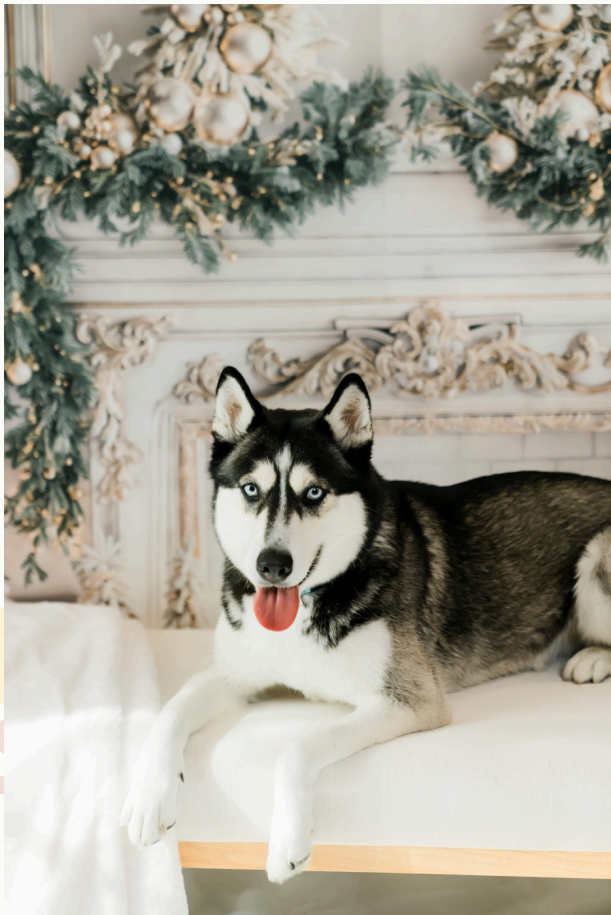
Adora the Husky