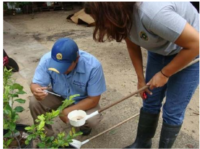
DCHHS staff examine a water sample for larvae at a home in Duncanville.

Generally, mosquitoes are classified as nuisance or disease carrying mosquitoes. There are more than 30 mosquito species in Dallas County, but there is one principle vector of West Nile Virus, the southern house mosquito ( Culex quinquefasciatus ). This mosquito overwinters as an adult and is active from spring to fall. As the name implies it readily enters homes and prefers highly-organic standing water especially in urban areas around the home. It feeds during late night hours mostly on birds but will occasionally feed on mammals including humans.